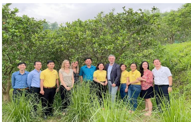
The Cooperative welcomes the European Union Delegation in April 2022

Cao Phong Orange is a famous orange brand in the whole country, which has been granted a geographical indication of “Cao Phong Oranges”