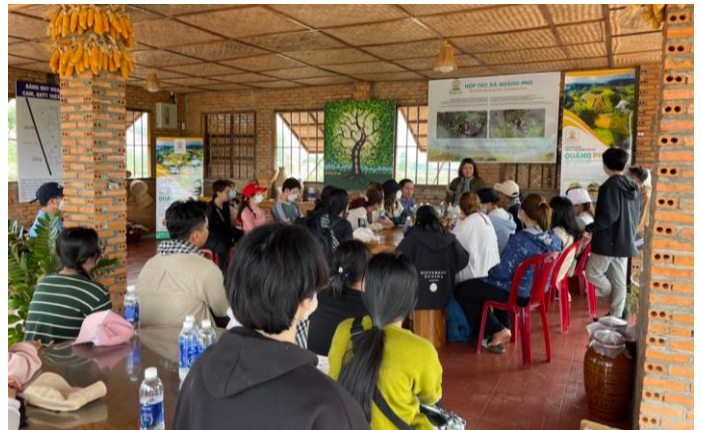
The Cooperative is sharing Eco-Fair philosophy with visitors

In the coming time, the Board of Management of the Cooperative develops a stable development plan for concentrated fruit tree area of about 45 hectares in the Cooperative as well as cooperating with other Cooperatives in the region to connect the planting area, at the same time promoting the application of science and technology to production, building brands for the products in domestic and international markets.