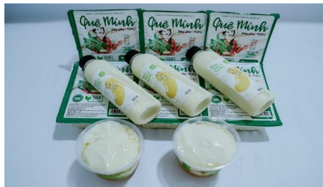
Some products with brand “Hometown tofu”

Green Nut products ensure cleanness from planting to processing. Manufacturing process is strictly supervised, ensuring transparency from farm to table. Soybeans products are manufactured based on the values of traditional products - no preservatives, no flavorings, no chemical additives, thereby winning not only Hanoian but also reaching out to the others provinces through clean food stores, supermarkets and convenience stores in Bac Ninh, Thanh Hoa, Thai Nguyen, Nghe An. The “Hometown tofu”-branded product was awarded the Capital Women’s Innovative Product Award 2021.