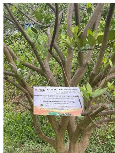
Pilot area for the plant-parasitic nematode control method

PROJECT: "PROMOTION OF SUPPLY AND DEMAND OF ECO-FAIR AGRI-FOOD PROCESSING PRODUCTS IN VIETNAM"