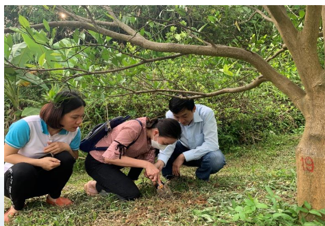
CCS experts and officials take soil samples at orange orchards

The project “Promotion of supply and demand of eco-fair agri-food processing products in Vietnam” (Eco-Fair Project) provides solutions and in-depth technical support for land reclamation and rehabilitate the growth capacity of 3T Cooperative orange orchards, then expand to all orange orchards in Cao Phong,