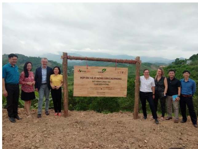
The Cooperative welcomes the European Union Delegation in April, 2022

In the coming time, the Eco-Fair project will accompany the Cooperative to support sustainable oranges farming, develop new processed products from oranges and further implement nutrition solutions, contributing to increasing the value of local agricultural products.