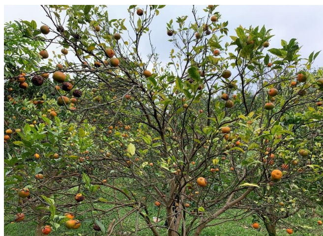
The diseases orange orchard affect to the productivity

since 2014. In recent years, it is facing many challenges, the planting area is seriously reduced. At 3T Farm Cooperative, including orange trees in the “strong” period (9 years) or sapling (under 4 years) have also suffered yellow leaves diseases and severe yield decline (up to 50% for 9 year garden).