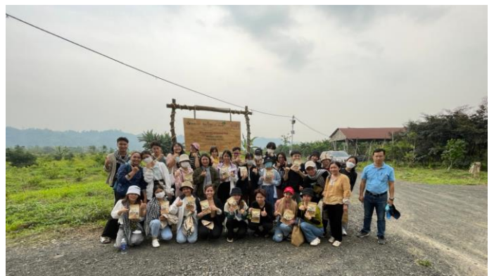
The Cooperative is sharing Eco-Fair philosophy with visitors

PROJECT: "PROMOTION OF SUPPLY AND DEMAND OF ECO-FAIR AGRI-FOOD PROCESSING PRODUCTS IN VIETNAM"