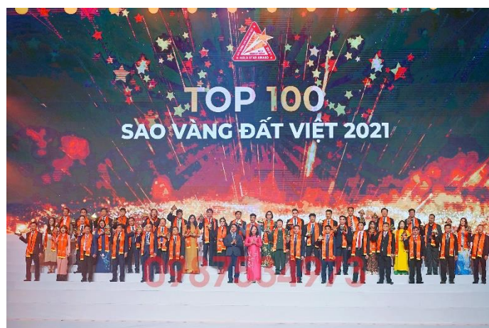
SEPON Group received the 3 rd Vietnam Gold Star Award in 2021

Since its establishment, SEPON has received many noble awards and certificates of merit from the Party and State, including “Enterprise for Farmers” (2016), National Quality Silver award (for its rubber products) awarded by the Ministry of Science and Technology (2017), 3 rd Class Independent Medal, Emulation Flag of the Government (2018), Vietnam Gold Star award for 3 times, Certificates of Merit from many ministries and sectors such as the Minister of Agriculture and Rural Development, Ministry of Industry and Trade, Ministry of Public Security (2018), etc.