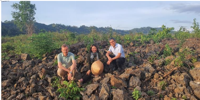
The Cooperative welcomes the European Union Delegation in April 2022

In addition, the Cooperative's products have also achieved the 4-star OCOP certificate of Dak Nong province.