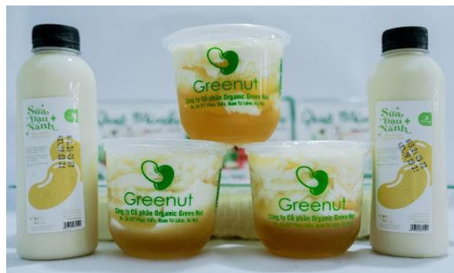
Some products of Green Nut