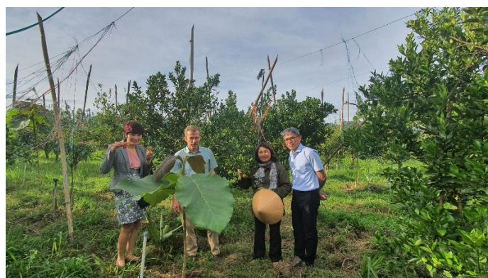
The Cooperative welcomes the European Union Delegation in April 2022

model in harmony with nature, without using chemicals. To protect the environment, the Cooperative adheres to the following principles: chemical fertilizers, herbicides, pesticides, genetically modified varieties are not allowed. During the farming process, the cooperative completely uses microbial organic fertilizers and medicines made from garlic, ginger, chili, lemongrass, cinnamon, and angelica... to take care of the plants. In order to enhance sweetness for the fruits, the Cooperative uses fermented papaya and bananas to fertilize the trees. According to Cooperative members, microbial organic fertilizers and herbal medicines on plants make relatively slow impact, but in return, this method ensures the safety of agricultural products, limits environmental pollution, and the soil gradually regains its nutrients.