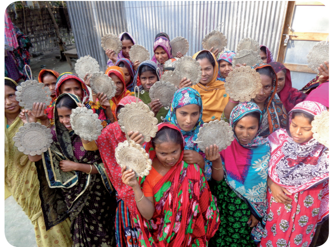
Trained JDP workers

The project prepared and published jute training modules consisting of 700 sets of flip chart on modern jute cultivation, retting and harvesting techniques. A manual for organic fertilizer production has also been developed. Database profiling of targeted 16 000 jute producers were compiled covering their livelihoods and other socio-economic state of affairs.