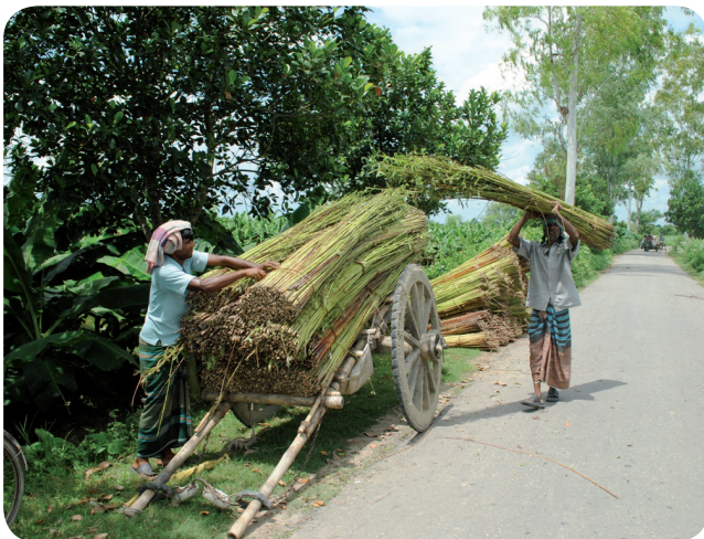
Farmers harvesting jute

The project enables representation and participation in international trade fairs and fashion events by the selected SMEs to promote JDPs from Bangladesh. The trade fairs result in not just the promotion and sales of Bangladeshi JDPs, but also act as a hub for information on market designs, specification and demand trends. Leveraging international experience and expertise in promoting JDPs creates a long-term demand and benefits the local market.