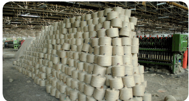
Factory processing jute