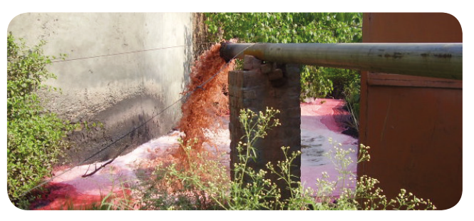
Wastewater from textile industry

The AWS Standard was designed to be an international standard defining a set of water stewardship principles, criteria, and indicators for how water should be managed at sites and watershed levels to be environmentally, socially, and economically beneficial. WWF-Pakistan introduced AWS Standards disseminating them through awareness seminars in Sialkot and Faisalabad. The project provided Nestlé-Pakistan with a three-day training session to build a network of accredited service providers for AWS Standard implementation. Technical services were provided to Nestlé for implementing AWS Standard in its Sheikhupura and Islamabad plants and to help its staff become accredited to the standard.