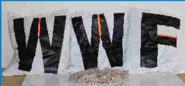
3- Recycling/Income generation for rural women by utilizing using cotton gin waste for house hold articles.