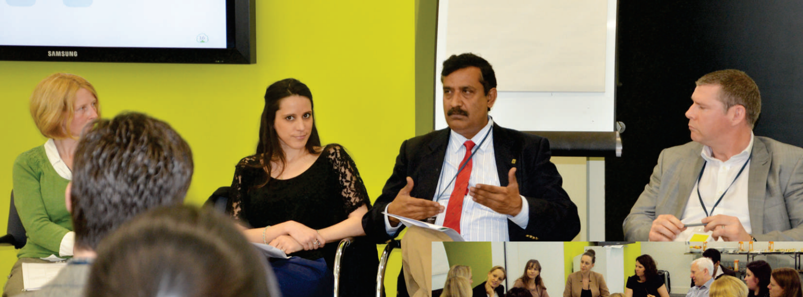
Senior Manager SAP, briefing audience about project progress

It is hoped that this seminar will help WWF & BCI efforts for promoting sustainable cotton sourcing among world leading brands, retailers & businesses leading to mainstreaming Better Cotton globally.