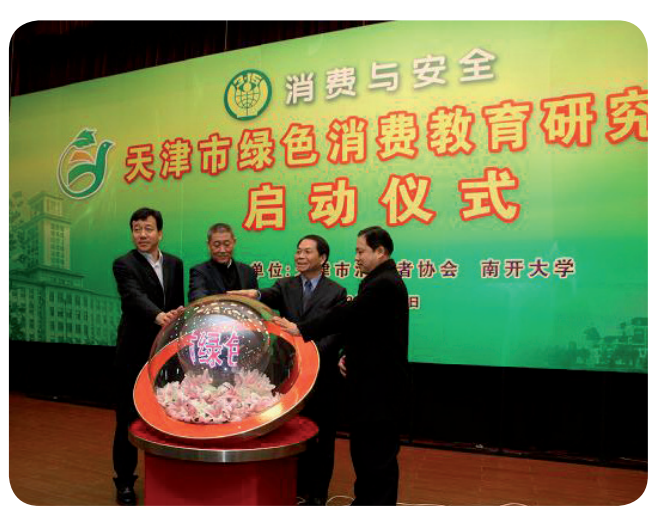
Launching of Tianjin Green Consumption School