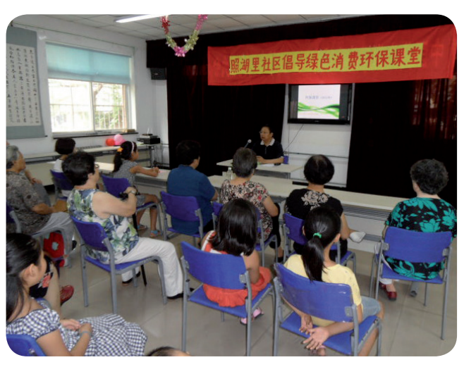
Consumer awareness raising

Addressing Consumers to Increase Market Pull The project simultaneously increased market pull for green products by raising awareness, building capacity in consumer associations, and transferring knowledge on best practice in sustainable consumption in the EU and in China. SME suppliers felt an impact by having to meet improved, but realistic, SC criteria to be competitive. Increasing the market for sustainable products offered SME suppliers opportunities to take innovative technical and managerial measures to produce more sustainable products. Key owners of this action were local consumer associations, local authorities, local retailers and SMEs suppliers.