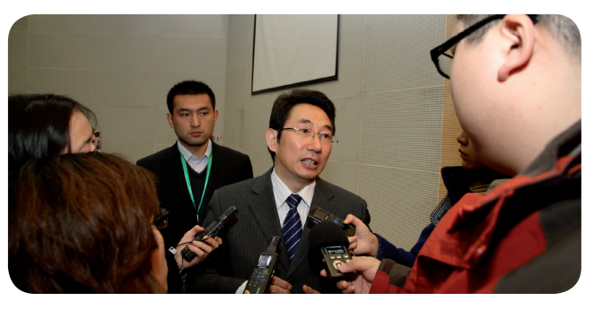
Local media coverage

Green Consumption School Established Results Media in both Beijing and Tianjin established programmes for communicating SC information, such as successful SC practice or national and regional SC policies. In both Beijing and Tianjin, project partners established a Green Consumption School – a weekly voluntary awareness programme open to all citizens in these mega-cities. These community green consumption schools offered various training courses and workshops to the public, raising awareness of SC and providing skills to identify green